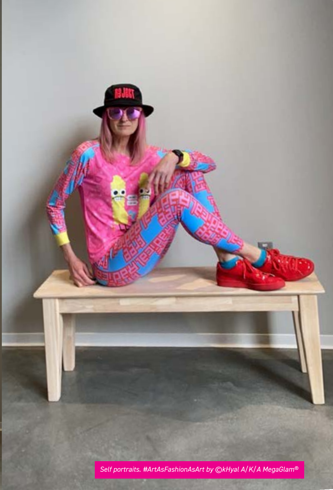
Self portraits. #ArtAsFashionAsArt by ©kHyal A/K/A MegaGlam®