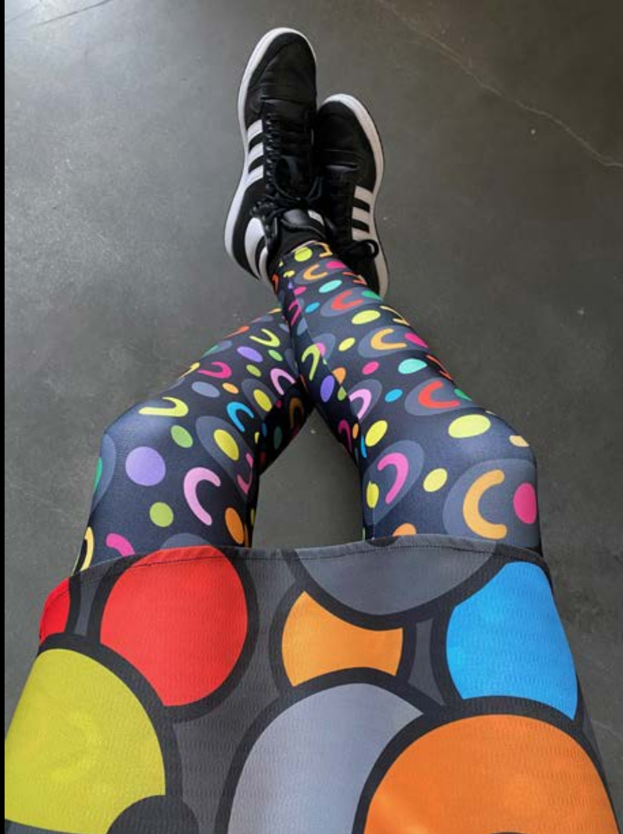
Self portrait. #ArtAsFashionAsArt by ©kHyal A/K/A MegaGlam®