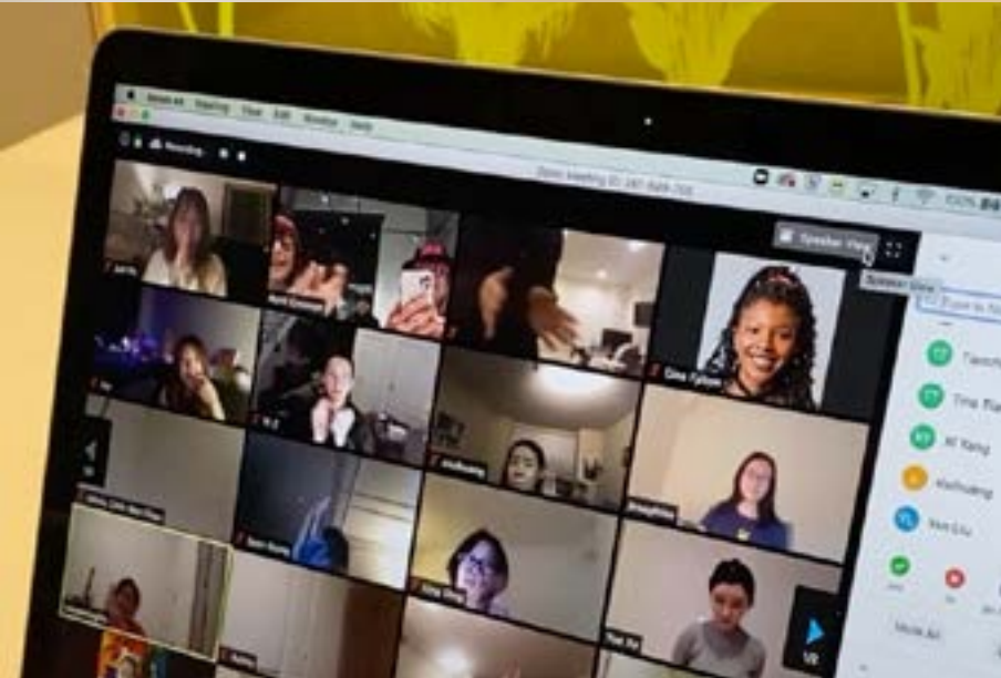
A fond farewell at the end of final student presentations via Zoom.