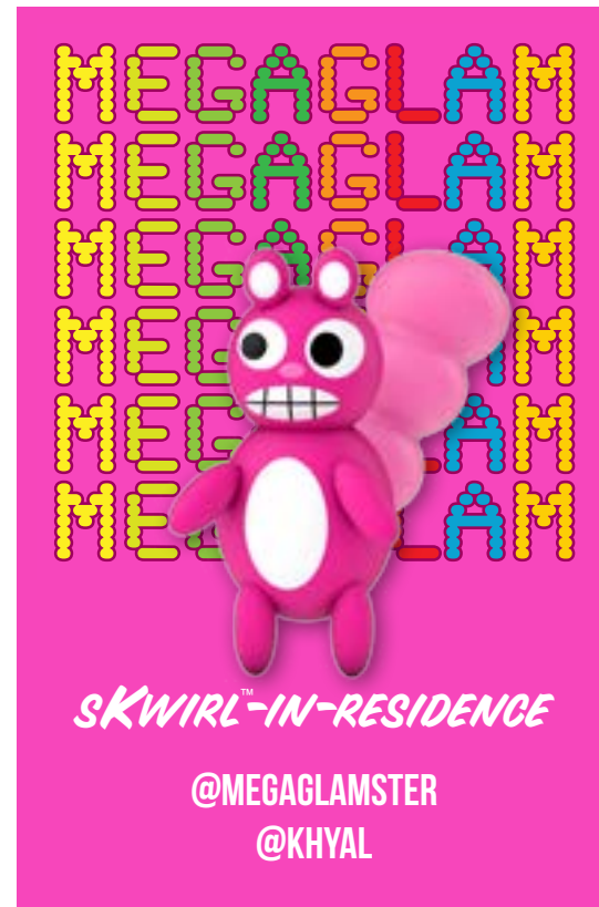
Transforming the resident studio into an installation space featuring my alter ego, and key character, The Weather sKwirl™.