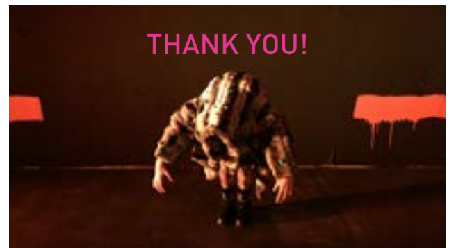
Photos: (Left to right) 1, 8, 9, 12 ©Karl Heine; 7 ©NBC News; 10 ©Shutterstock; 11 ©Getty Images