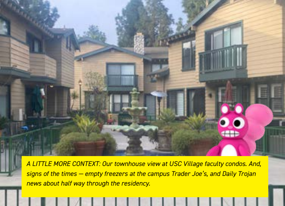
A LITTLE MORE CONTEXT: Our townhouse view at USC Village faculty condos. And, signs of the times — empty freezers at the campus Trader Joe's, and Daily Trojan news about half way through the residency.