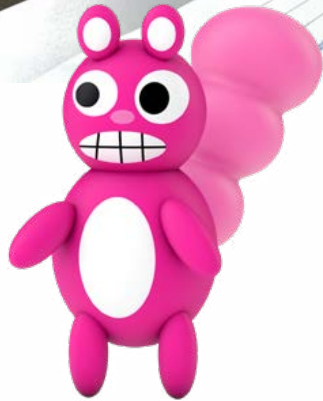
Self portrait. #ArtAsFashionAsArt by ©kHyal A/K/A MegaGlam®