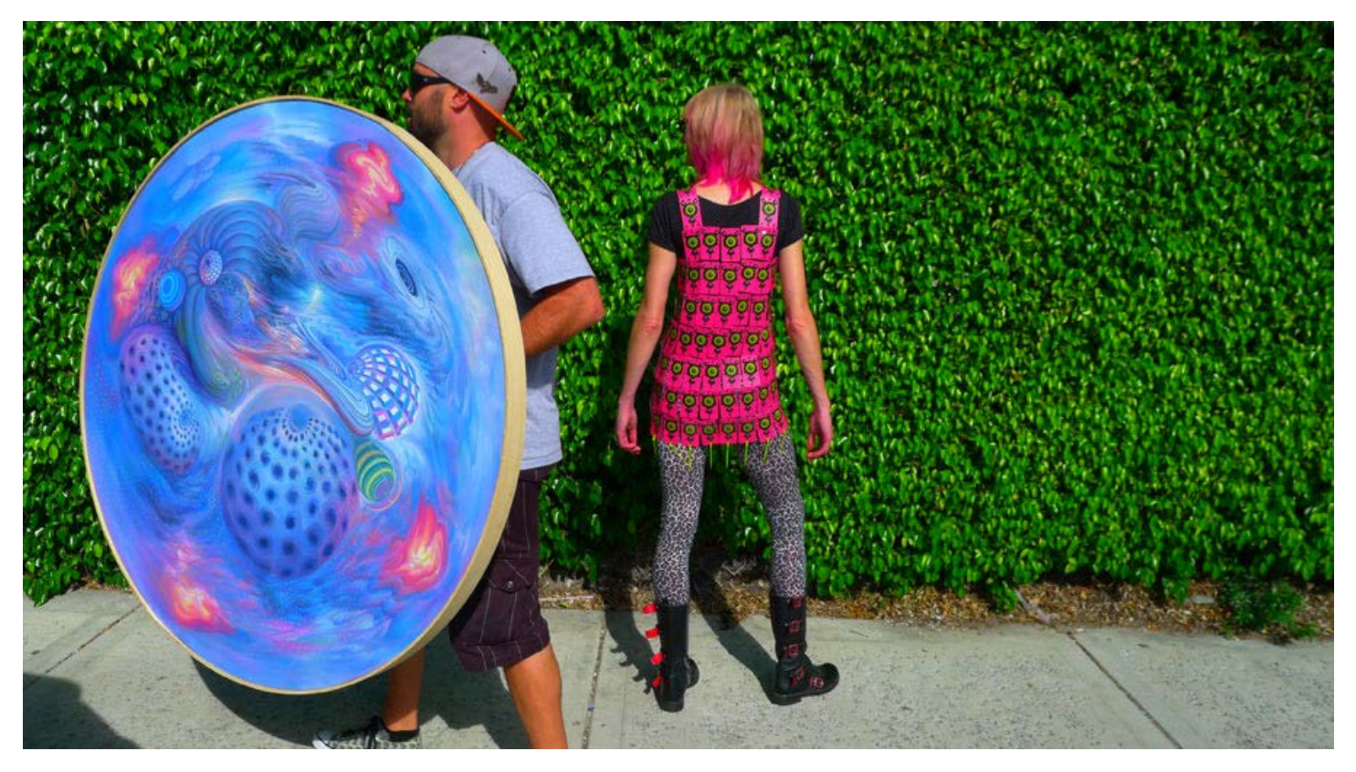
Pulse Art Fair VIP Preview, Miami Art Week.

Q: Your work delivers so much punch! It also merges together many different elements (i.e. art, illustration, surface, product, textiles, and fashion design). This is a mixture that not many artists successfully bring together. How did MegaGlam begin?