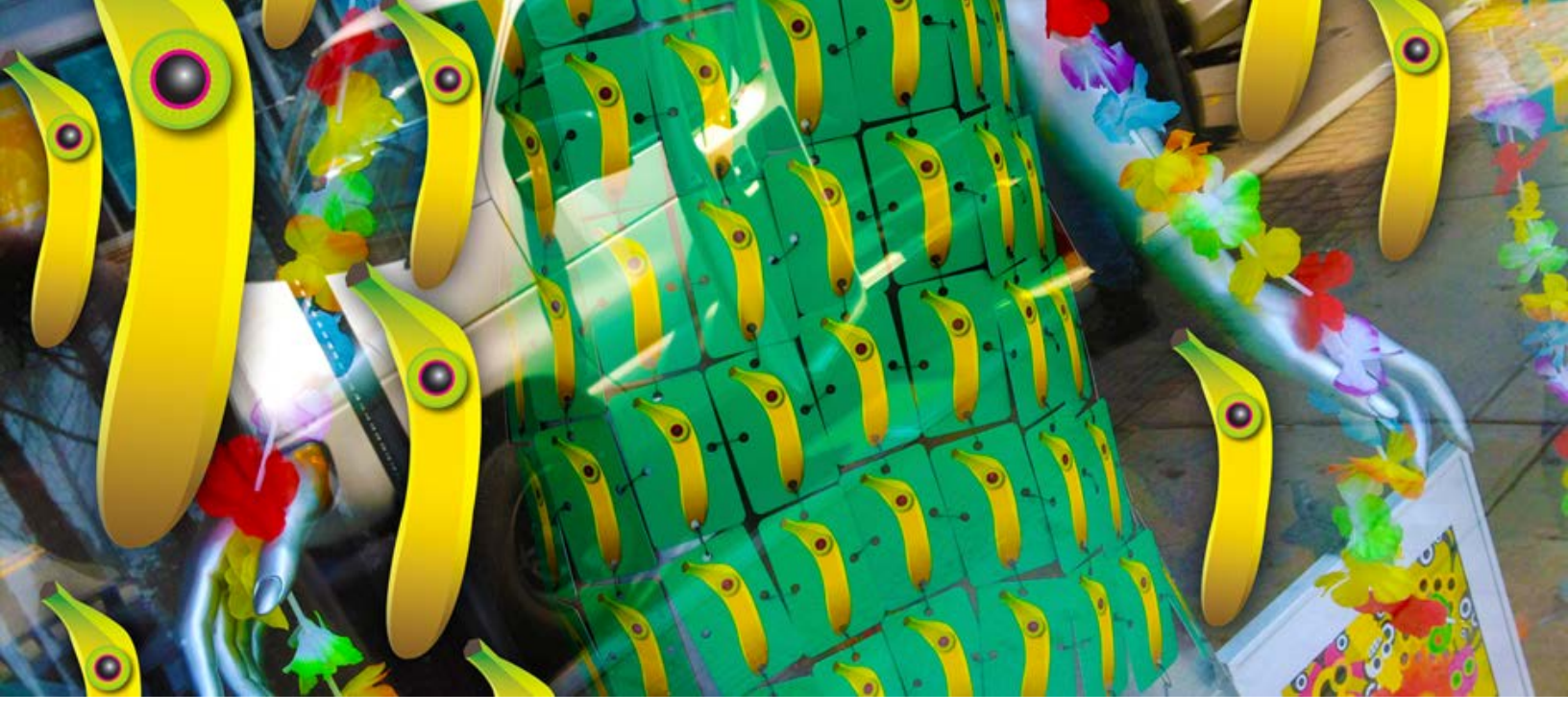
Installation at Look In The Windows, SoNo, image courtesy of the artist.

Food related icons, like eggs, sausages and bacon are a long-time compulsion. I have always loved breakfast, and in my early twenties I was a model and anorexic. I was trying to disappear and reduce my visibility by not eating, but this backfired on me. I seemed to have starved in an aesthetic way that made me more attractive, which is why the modeling agencies hired me for runway work. So, back to sausage and eggs smiles. I love images of breakfast foods, then and now. And, though I don't eat meat, I like drawing my own versions of it.