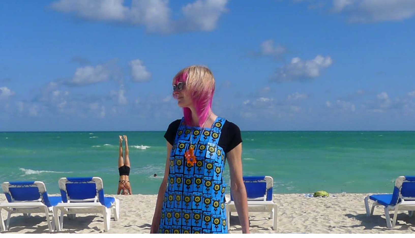
Outside NADA Preview, Miami Art Week.

Q: From a design standpoint, what inspires your pattern work and illustrations? The color palette is very vibrant in both your abstract or character designs. Looking at designs such as Rainbow Target Mutli or Sausage and Egg Smiles verses the MegaGlam Bubble Creatures or Weather sKwirls?