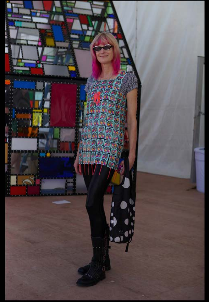
FASHION Magazine, Canada.

** The violet ray machine was designed for basic home use: it was manufactured by the Master Electric Company of Chicago, circa 1920.