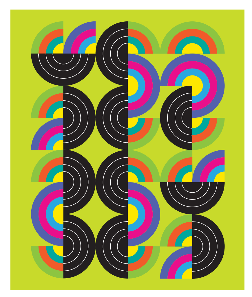
Target Rainbow.

Q: What is the greatest piece of career or personal advice you ever received?